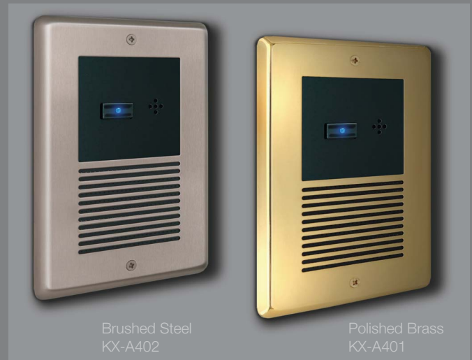
Brushed Steel KX-A402

A range of stylish metal faceplates are available: