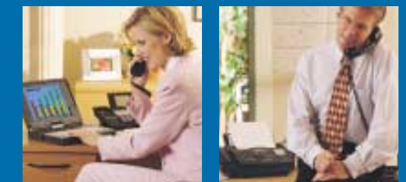
Talk and send data at the same time.