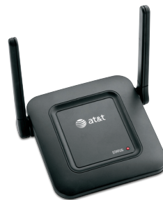
SB67128 Accessory Repeater