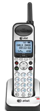
SB67108 Cordless Handset