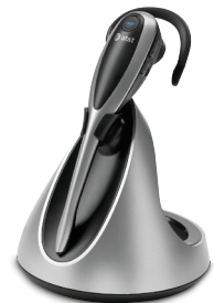
TL7600 Cordless Headset